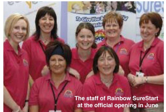
The staff of Rainbow SureStart at the official opening in June

"As co-ordinator I would like to take this opportunity to applaud the hard work and dedication of a devoted multi disciplinary team who are committed in working to a common plan. It takes drive to sell the SureStart idea and create partnerships and having the encouragement and support from Early Years - the organisation for young children has attributed to the development of Rainbow SureStart. Finally, we can't forget to congratulate the families who also make time to attend programmes and avail of the services Rainbow SureStart Provides; without whose support our journey would come to an end" .