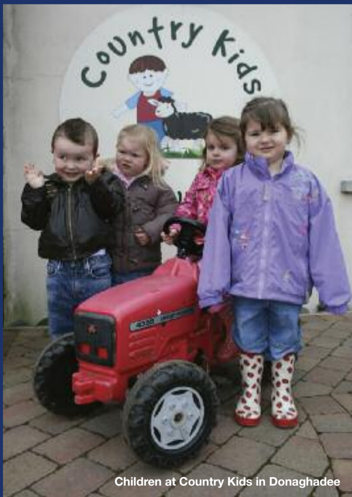
Children at Country Kids in Donaghadee

The centre has a workforce of over 20 staff, both full and part time, including a cook, manager and an administrator. Staff development is encouraged and staff are fully trained in all areas of childcare, attending relevant training to enhance their skills.