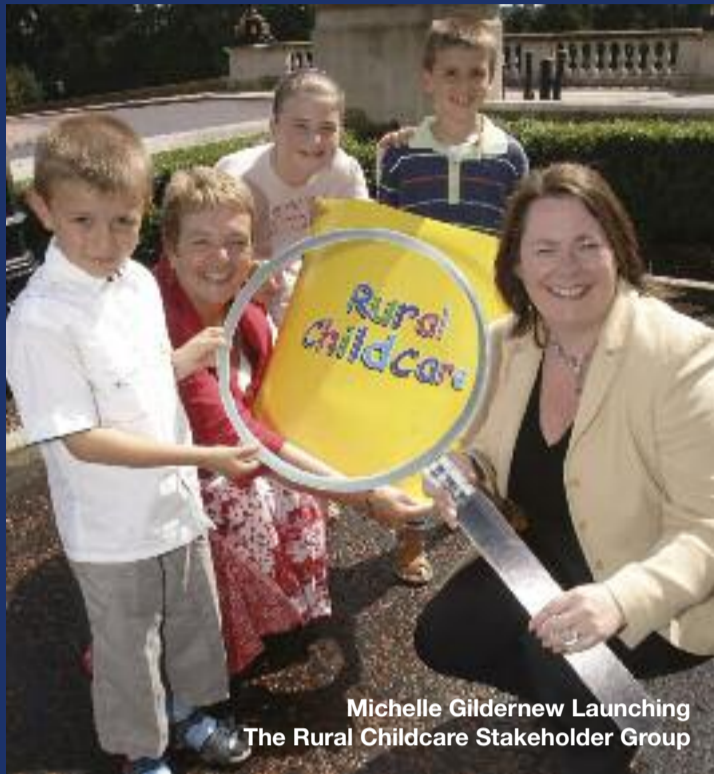
Michelle Gildernew Launching The Rural Childcare Stakeholder Group

Rural Childcare is an important issue in the development of rural communities and promoting rural and economic development. The Department of Agriculture and Rural Development has established a Rural Childcare Stakeholder Group to examine the issues and needs of rural childcare in Northern Ireland. The group will report back to the Minister, Michelle Gildernew, and launch a report in the next few months.