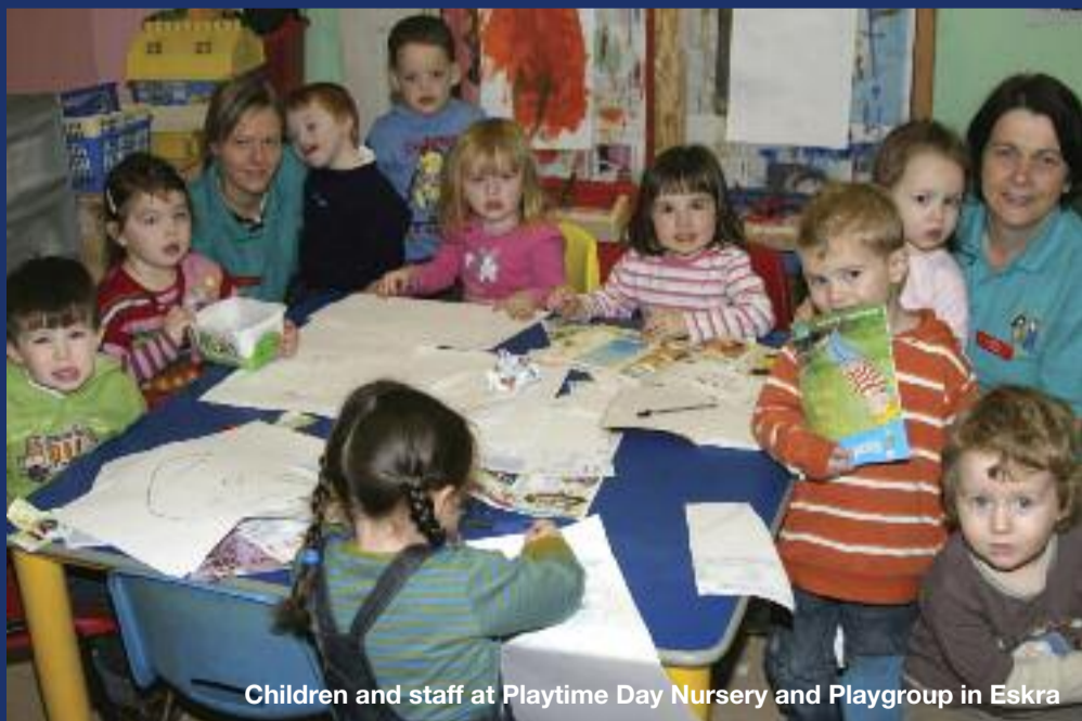
Children and staff at Playtime Day Nursery and Playgroup in Eskra

It is with this knowledge that Early Years will carry out extensive research on the impact of quality physical environments, physical activity, quality interaction on children's levels of involvement and well being. This is in keeping with our strategy to provide evidence based programmes that deliver outcomes for children and their families.