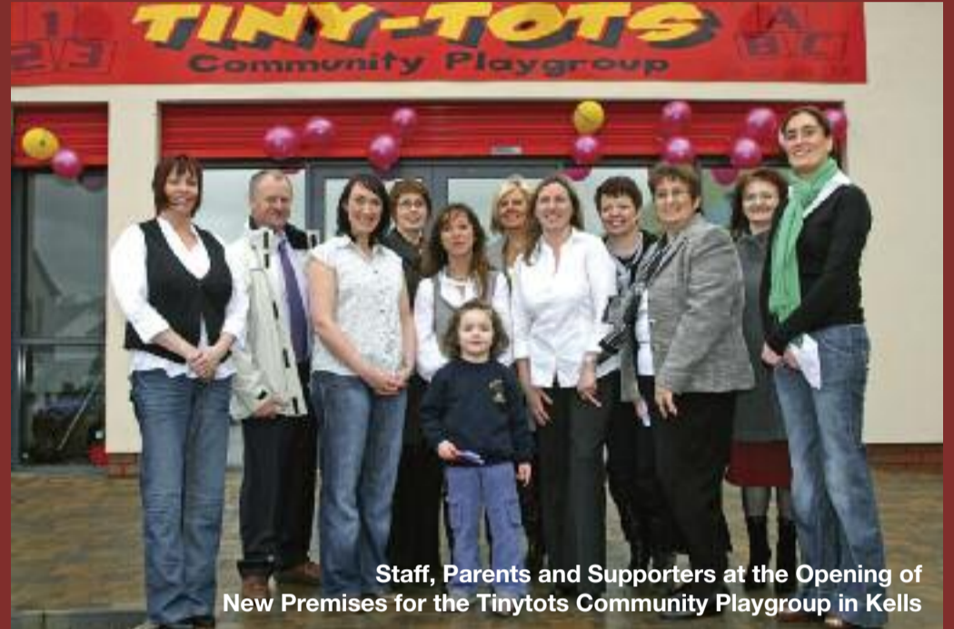
Staff, Parents and Supporters at the Opening of New Premises for the Tinytots Community Playgroup in Kells

"We look forward to being able to service the local community in the future by providing more high quality child care to many more families. We hope that our next project will be the development of an outdoor play area at these premises which would further enhance our child care provision in the area."