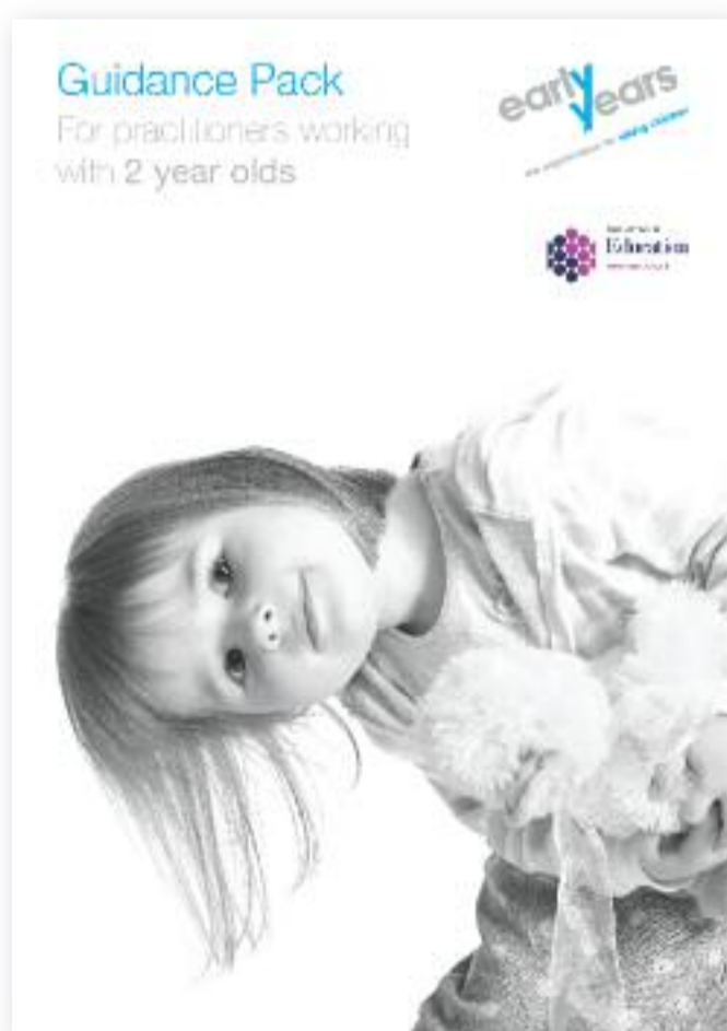
New Two Year Old Guidance Pack

The Department of Education has commissioned Early Years to produce a Training of Trainers programme which will enable Sure Start staff to continue to deliver the training to SureStart projects throughout Northern Ireland. This Training of Trainer's Programme began in February 2008 with a mix of trainers from SureStart projects and NICMA.